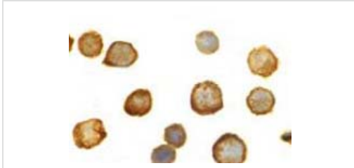
ab37071 at 10µg/ml staining TLR5 in THP-1 cells by ICC/IF

Immunocytochemistry/ Immunofluorescence - Anti-TLR5 antibody (ab37071)