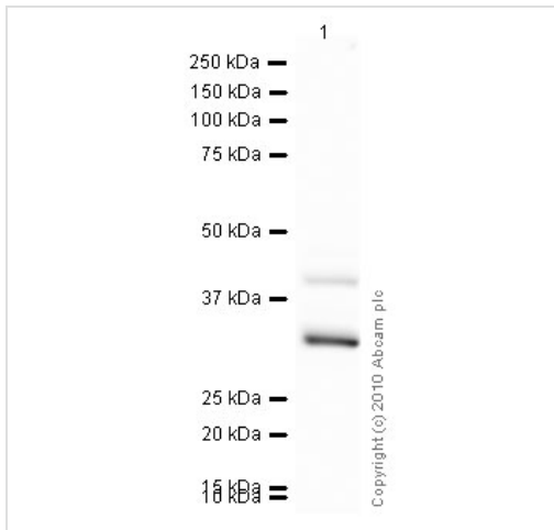
Western blot - Anti-GODZ antibody (ab31837)

Anti-GODZ antibody (ab31837) at 1 µg/ml + Cerebellum (Mouse) Tissue Lysate at 20 µg