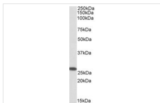
Western blot - Anti-CHCHD3 antibody (ab99491)

Anti-CHCHD3 antibody (ab99491) at 0.3 µg/ml + Human Placenta lysate (in RIPA buffer) at 35 µg